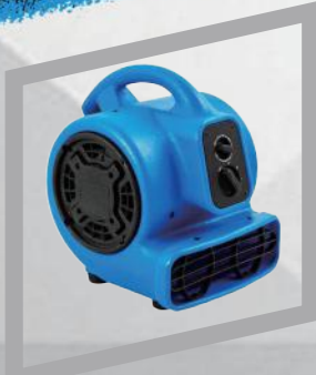
AM20 1/5HP Mini Air Mover

Power Input: 110V/60HZ Power: 1/5hp Current: 2.5amp Rpm: 1550rpm Air Volume: 650cfm Max Air Speed: 18m/s Distance: 8m Unit Size: 35*27*32cm Box Size: 36*28*34cm N.W.: 5.2kg G.W.: 6.2kg Loading QTY: 20gp 1000pcs 40gp 2000pcs 40hq 2350pcs