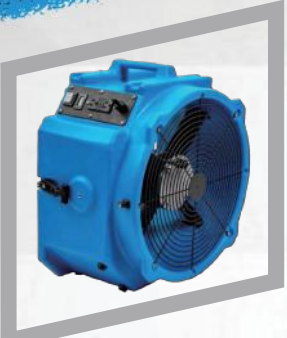
510 1/4hp Axial Air Mover

Power Input: 115V/60HZ Power: 1/4hp Current: 3.2amp Rpm: 1540rpm Air Volume: 4000cfm Max Air Speed: 11.5m/s Distance: 10m Unit Size: 52*31*56cm Box Size: 54*33*58cm N.W.: 15kg G.W.: 16.3kg Loading QTY: 20gp 300pcs 40gp 600pcs 40hq 680pcs