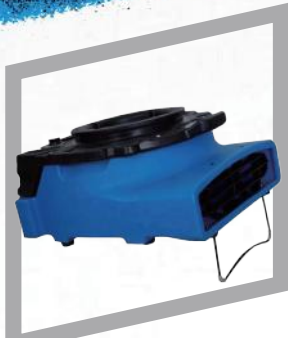
AM25LO 1/4HP Low Profile Air Mover

Power Input: 115V/60HZ Power: 1/4hp Current: 1.9A Air Volume: 1100cfm Max Air Speed: 14m/s Distance: 6.5m Unit Size: 53*45*26cm Box Size: 54*46*27cm N.W.: 12kg G.W.: 13kg Loading QTY: 20gp 400pcs 40gp 800pcs 40hq 1000pcs