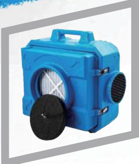
Air Scrubbers AF500 500CFM Air Scrubber

Power Input: 115V/60HZ Power: 1/3hp Current: 1.9amp Rpm: 2900rpm Air Volume: 300-500cfm CADR: 480m3/h Pre-filter: 40*40*2cm MERV10 Hepa Filter: 40*48*5cm H13 Noise Level: 66DB Unit Size: 63*40*61cm Box Size: 64*41*62.5cm N.W.: 17.5kg G.W.: 19.5kg Loading QTY: 20gp 190pcs 40gp 380pcs 40hq 420pcs